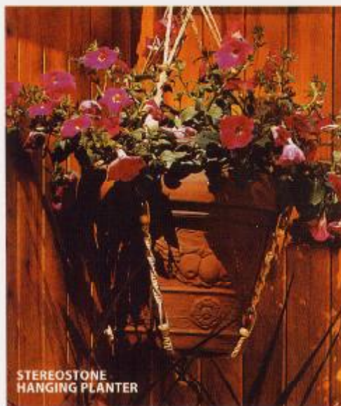
STEREOSTONE HANGING PLANTER

For more information, go to www.stereostone.com .